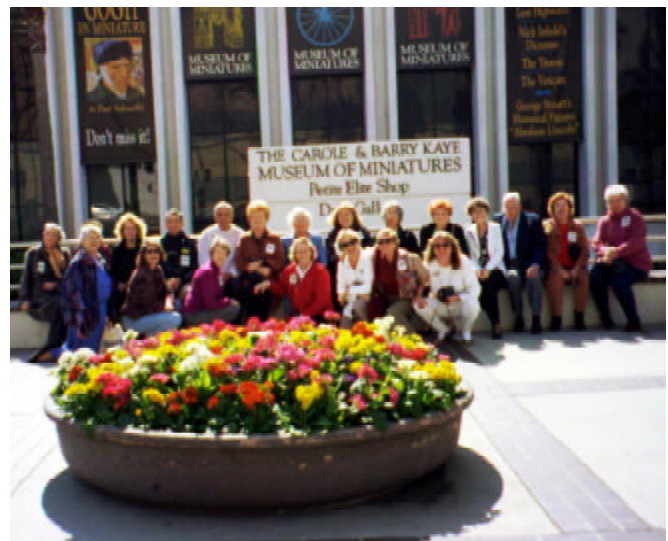
A group of 22 toured the Museum of Miniatures