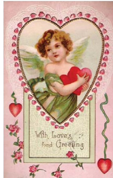
This event is sponsored by Antique Street Faire